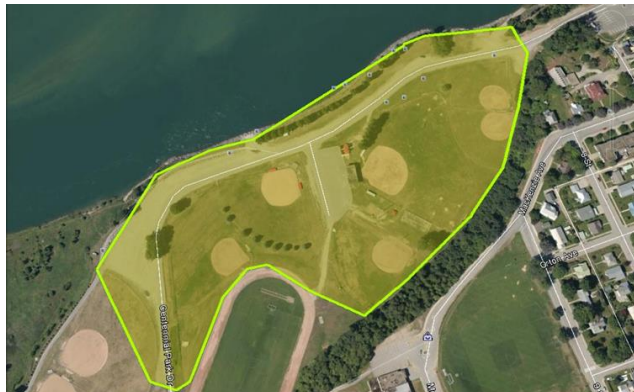
Base Camp (Revelstoke Ball Diamonds)

The location for the Base Camp is pre-determined by The Calling . The proposed location for Base Camp is Revelstoke Ball Diamonds. The Coordinator must provide a detailed Site Plan which includes the following: Access/Exit Routes, Disability Access/Exit, Accessible Facilities, Parking Plan, Vender/Supplier Areas, Stage/Spectator Area, Perimeter, Staff/VIP/Media Areas, Medical Layout, Media Areas, Liquor Service Areas, Security Layout, Porta Potty areas, Waste Management Area, Designated Smoking Area.