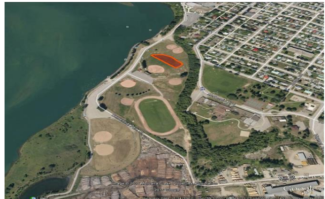
Freestyle Demonstration (Revelstoke Ball Diamonds)